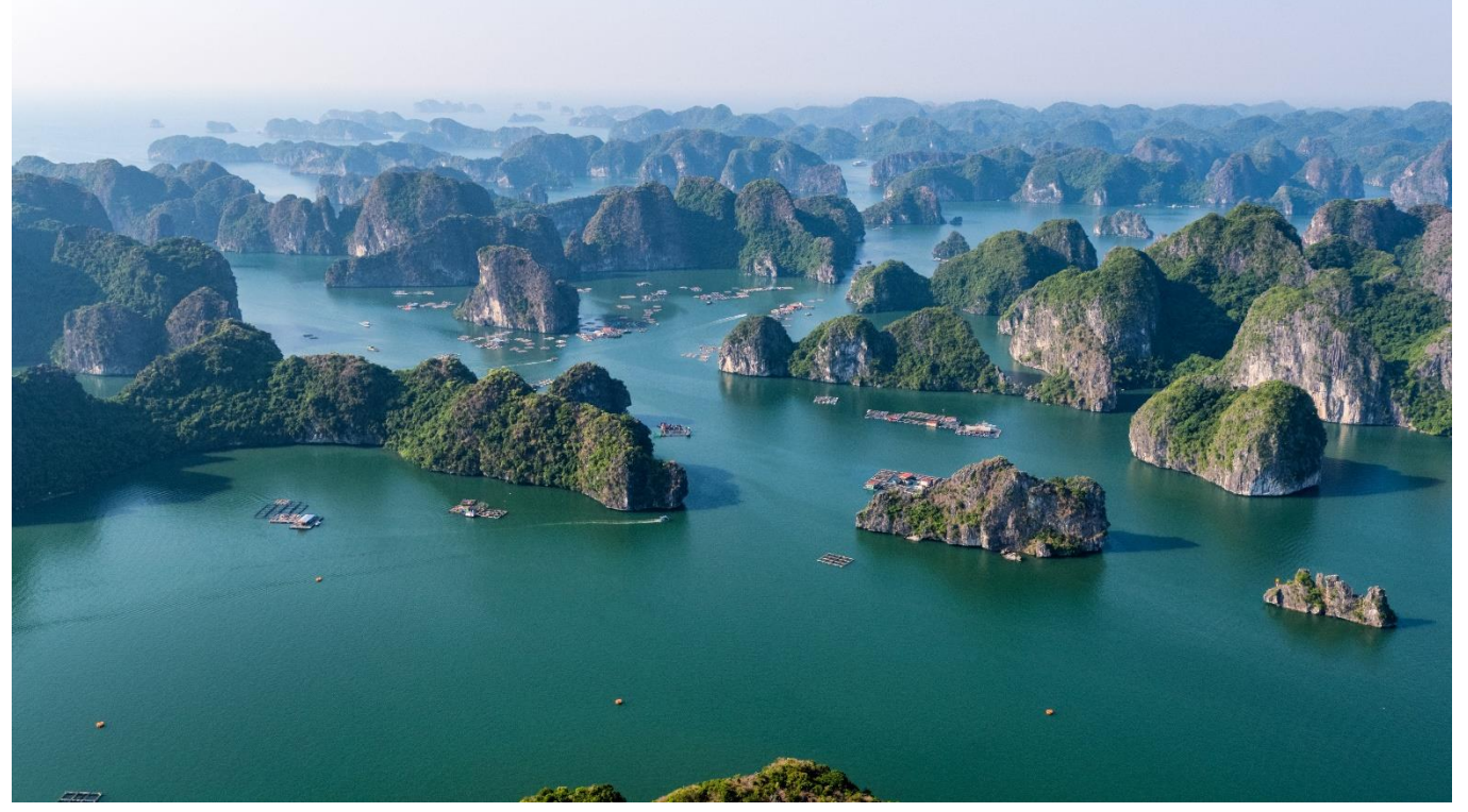
Ha Long Bay

Note: the itinerary of Halong will be changed based on which cruise you choose and depending on the weather without prior notice