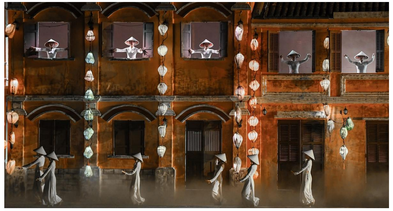
Hoi An Memories Show