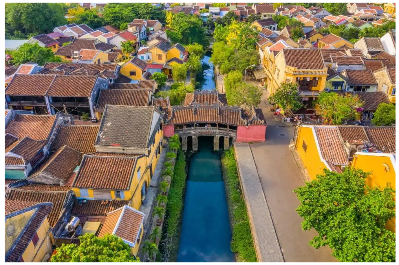
Japanese Covered Bridge Pagoda