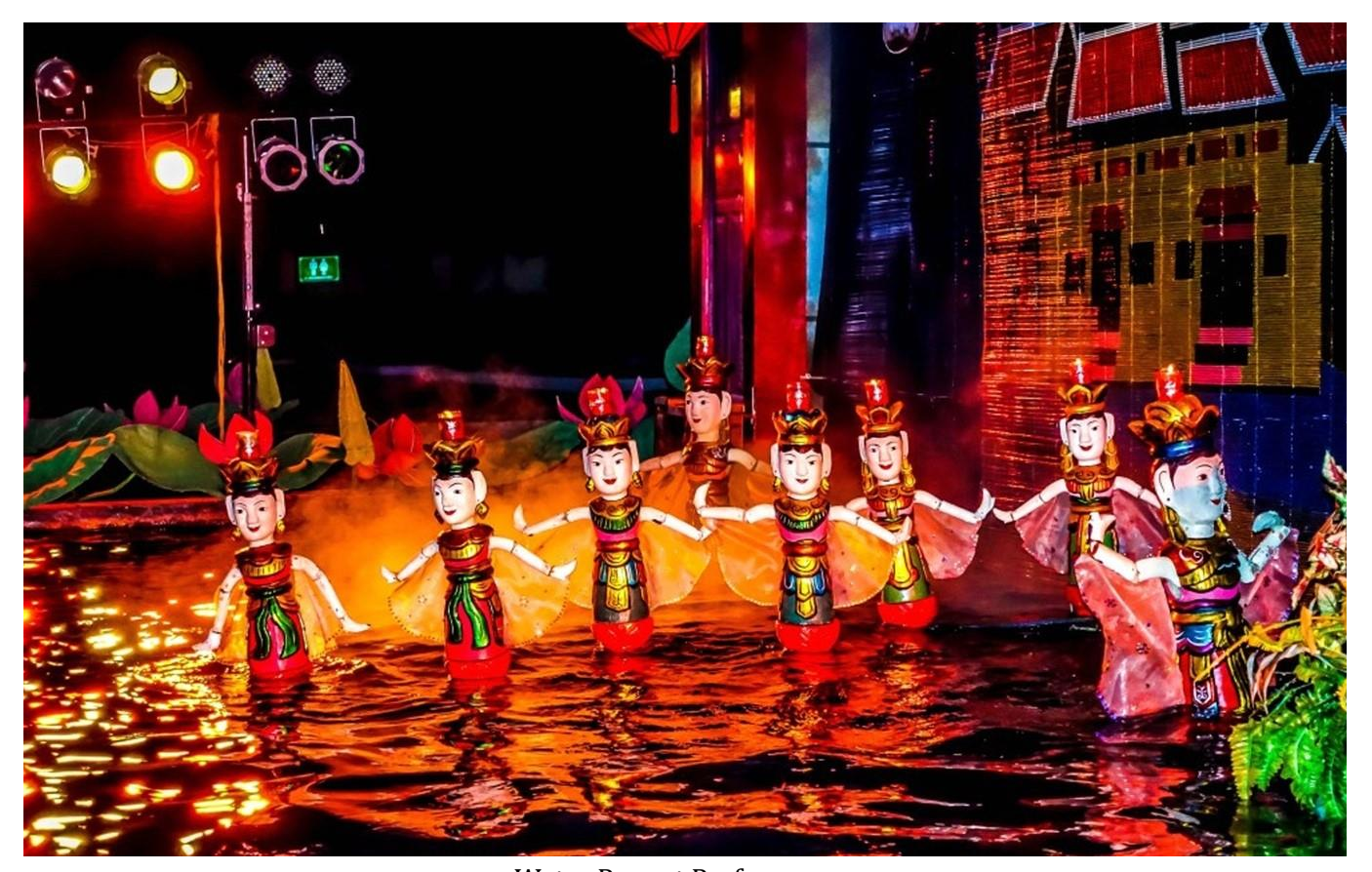
Water Puppet Performance.