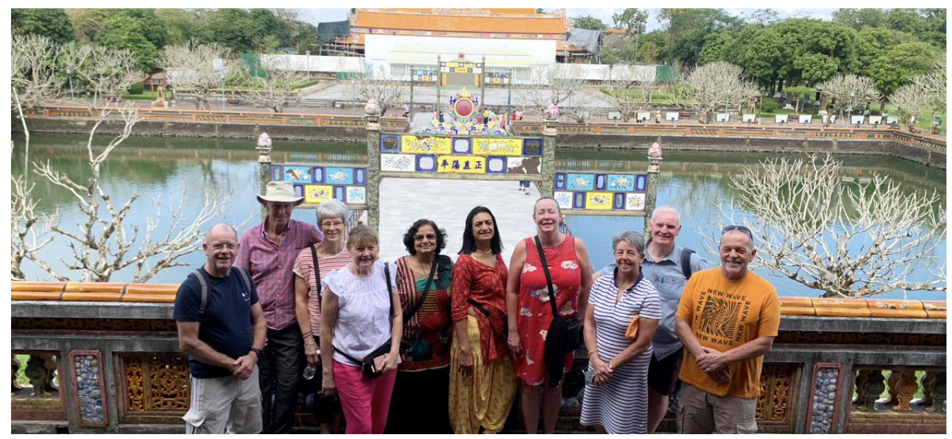
Hue Imperial City

The scenic drive from Hoi An hugs the coastline to Hue, the former capital of Vietnam. See My Khe beach . With a stop at Pass of Ocean Clouds (Hai Van Pass) and the scenic Fishing Village Of Lang Co .