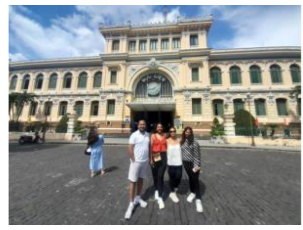
Central Post Office

Transfer back to Saigon for lunch and a half day city tour, seeing the beautiful structures from the French Colonial times such as the Notre Dame Cathedral , the historic Central Post Office . Followed by the remarkable site of the War Remnants Museum the museum has a vast display of the both the Indochina wars.