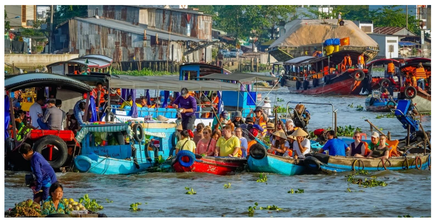
Cai Rang Market

Visit Cai Rang - the market is unique culture of local people living along this mighty river. Instead of shopping in the town, they shop and barter on the river that is more convenient to access by waterways.